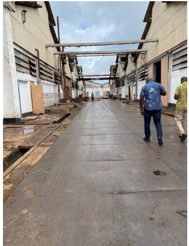
Photo: Visit at one of the largest textile manufacturers in Ghana. Open sewage drain from production can be seen on the photo to the left.

The survey describes the Ghanaian market in a form that presents relevant baseline information for Danish companies considering an entry into the Ghanaian market.