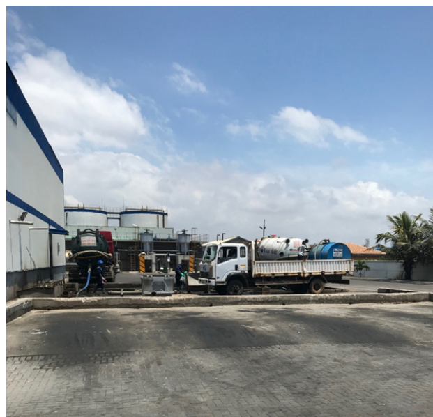
Photo from a 2000 metric tons/day treatment plant treating wastewater from septic tanks in Accra.