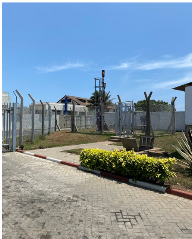
Photo of the flaring system at a municipal wastewater treatment plant.

The Chinese plant is controlled manually, and in general not operated efficiently. It would be relevant to apply real time monitoring and process control systems. Further serious corrosion issues were obvious on the Chinese plant despite being newer than the British plant.