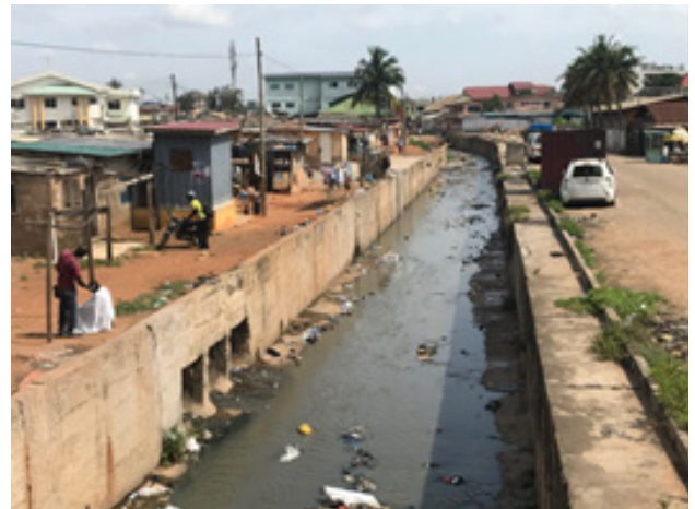
Photo of sewage/storm water Nima Drain in Accra.

Industries in Ghana require different treatment technologies, from full treatment solutions to separate sub processes for polishing of secondary effluent and sustainable use/reuse of water. For example, treatment plants require solutions for gas harvesting and energy production, where as treatment of wastewater from Ghana's budding oil