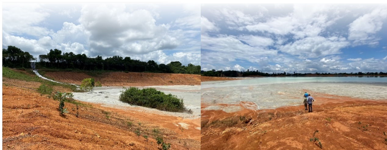
Photos of a sedimentation lagoon at a mining site in Ghana. Ramboll consultants visiting the lagoon.

The main objective is to find the matching Danish technology and provide an expression of interest from the Danish companies. The dialogue with the Danish companies will be based on findings from the Ghanaian companies and “external tools” to support the market approach.