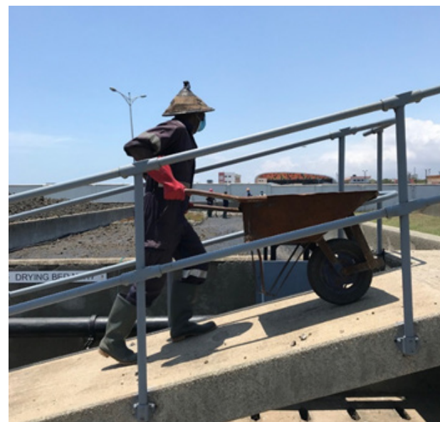
Photo: sludge handling at a municipal wastewater treatment plant in Accra.

For the existing plants, despite the procurement being tied to the discretion and approval by the original project financiers, they are open to procuring technology from other countries.