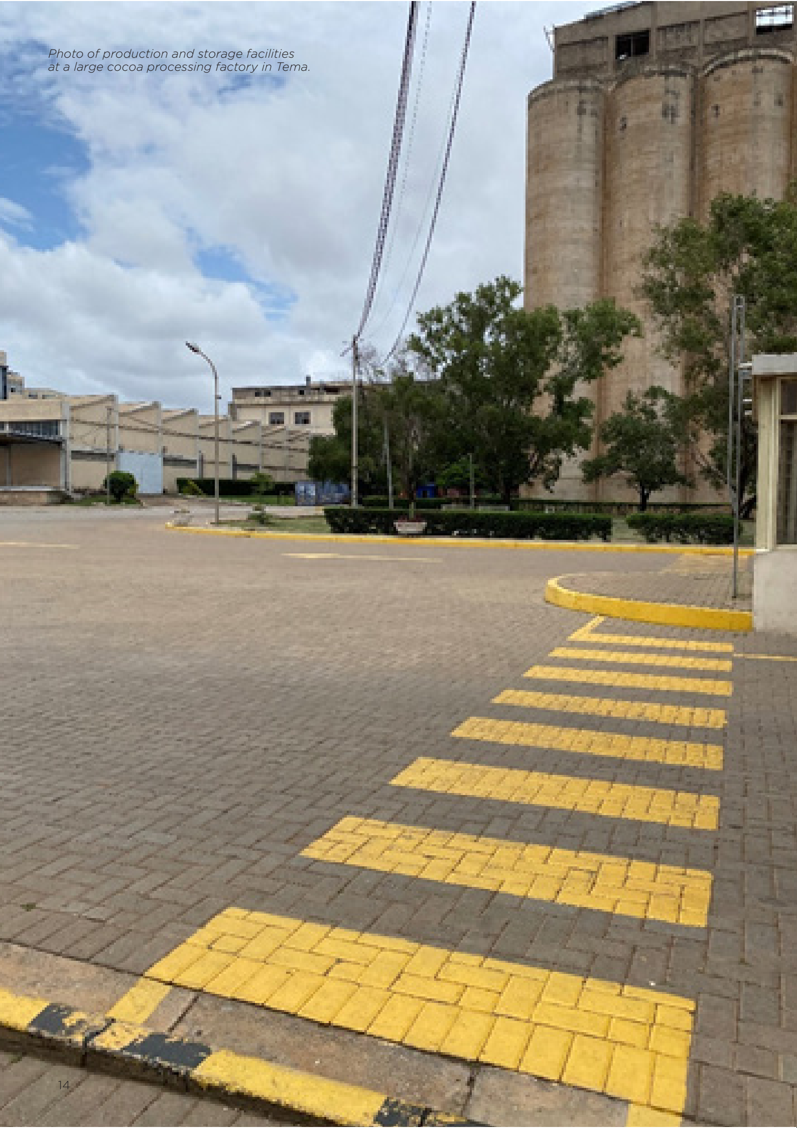
Photo of production and storage facilities at a large cocoa processing factory in Tema.