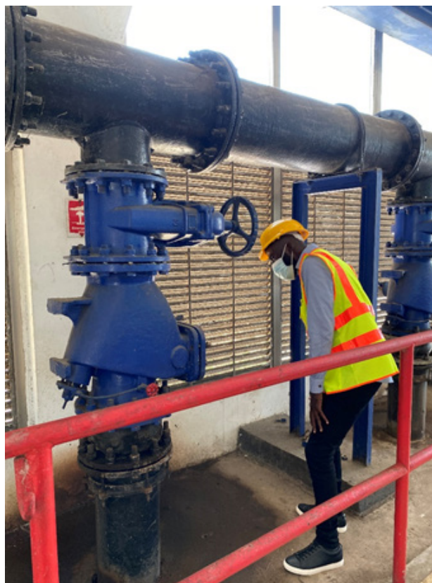
Photo of large valves (not AVK) at a municipal wastewater treatment plant.

The skill level for the operators of the facilities is not high. This should be considered when suggesting different technologies.