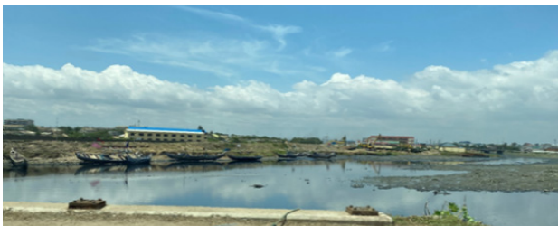
Photo of the polluted Korle lagoon next to a sewage treatment plant.