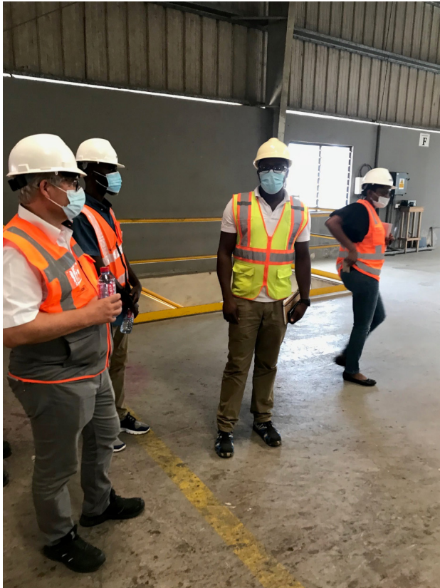
Photo of Ramboll international consultants at a wastewater treatment installation for the oil & gas industry in Sekondi-Takoradi. Facility has the capacity to treat about 250 cubic meters of oil wastewater per day.

This section describes the overall methodology applied in order to assess the wastewater market in Ghana.