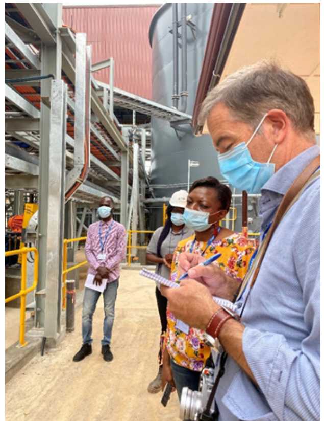
Photo of Trade Council expert and Ramboll international and local consultants at a wastewater treatment plant at a gold mining company in the Western region of Ghana. There are over 16 of such mining companies across the country.