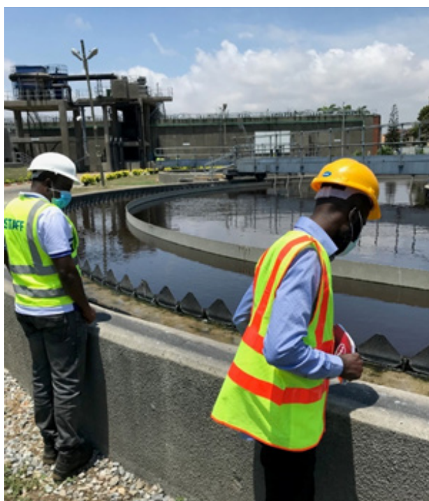
Photo of Ramboll international and local consultants visiting the largest municipal wastewater treatment plant in Accra.