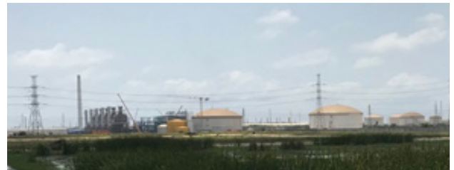
Photo of an industrial park in Ghana.

It is difficult to assess the business potential for now, but the Trade Council continues to monitor developments and can facilitate access to the relevant contacts in order for Danish companies to get an opportunity to take part in the tendering process.