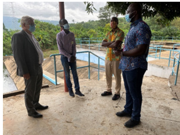
Photo: Ramboll consultants discussing treatment efficiency with local wastewater plant operators at a textile industry in Eastern Region of Ghana near the Volta River.

The largest investments are estimated by GWI to be within sewage systems, whereas the wastewater treatment plants only include around 20% of the total wastewater CAPEX investments. Overall, the data from GWI indicate that there is a stable situation and a considerable growth.