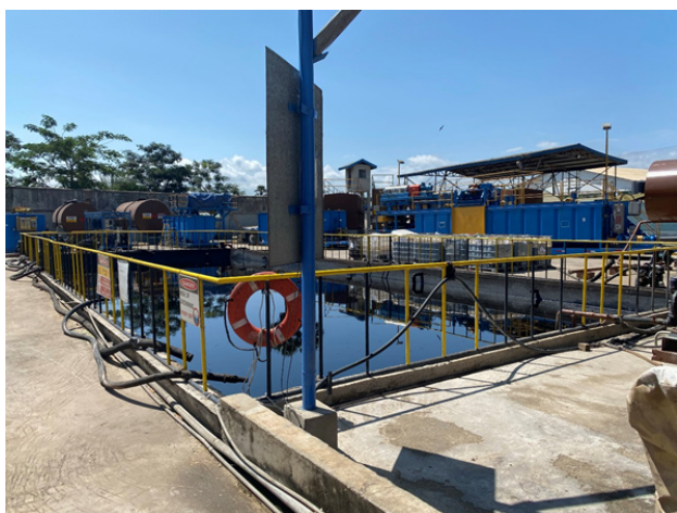
Photo from wastewater treatment plant in Western Region of Ghana, treating wastewater from offshore oil drilling rigs.