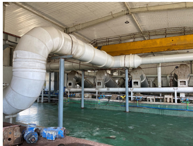
Photo: Sewage treatment at a municipal wastewater treatment plant in Accra.

The two sites that were visited were of British and Chinese technology, with British and Chinese