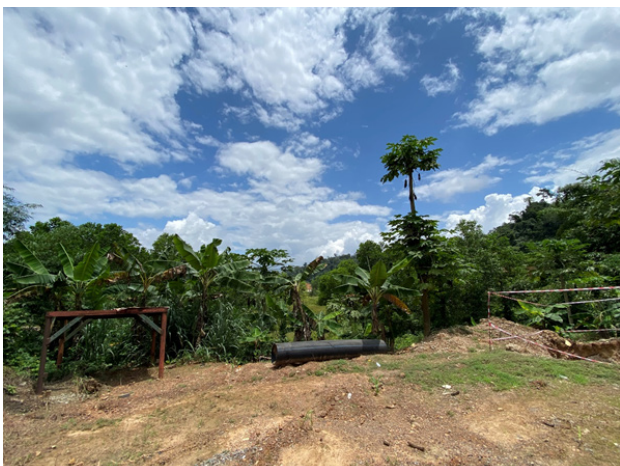
Photo of planned site for wastewater treatment plant at a Gold Mine in Ghana.