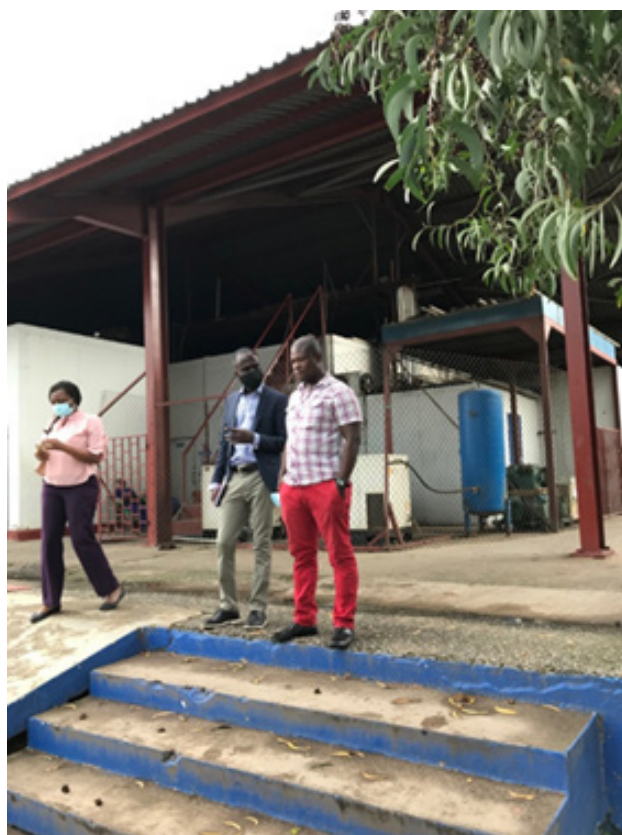
Photo: Visit to fruits cut processing facility for export on the outskirts of Accra.

systems delivered by foreign providers; however certain technical and operational challenges have resulted in shortfalls in meeting effluent standards. The technical issues could be solved by Danish knowledge and technology, but the local companies would then not be able to maintain the guarantee provided by the company that originally set up the treatment system. The companies can potentially be locked to a certain supplier in order to maintain the guarantee.